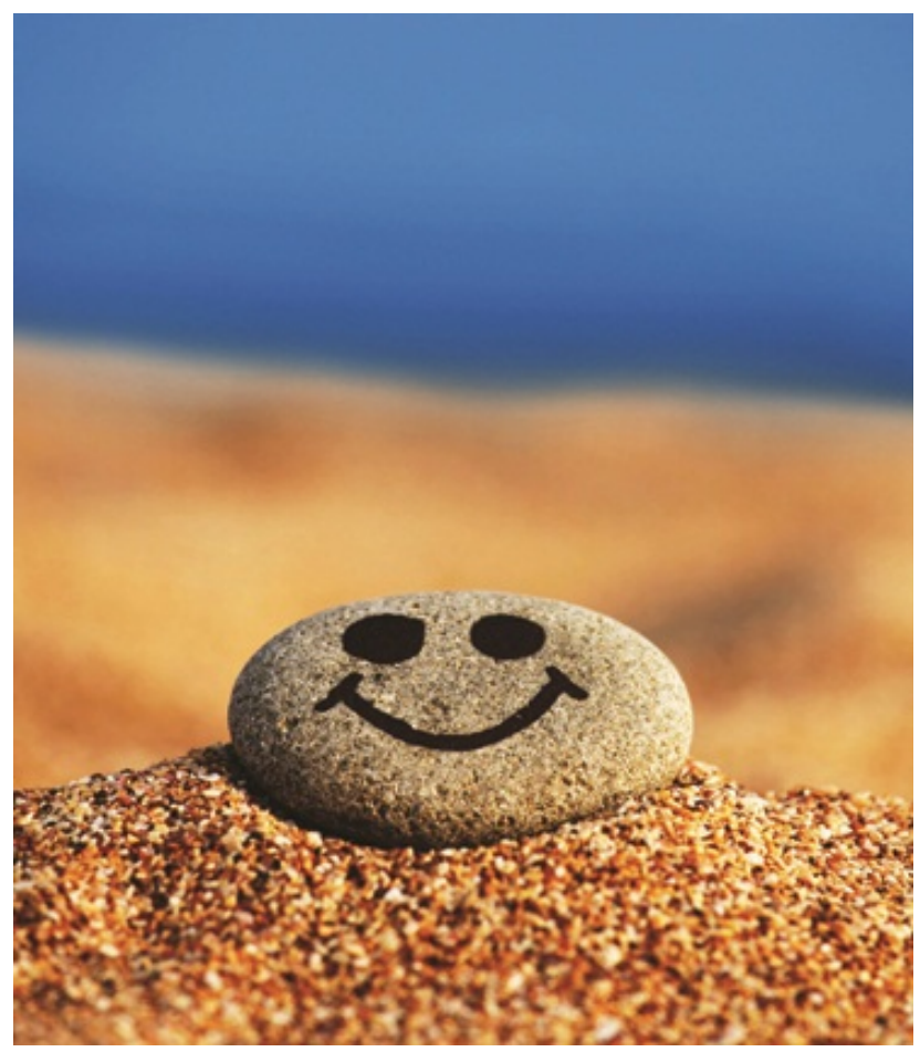
The value of bodywork runs deep, for nothing is more valuable than good health.

Truly, massage is more than a luxury--it's a vital part of self-care that has a positive ripple effect on you as you work, play, and care for others. Investing in your health is one investment that's sure to pay off.